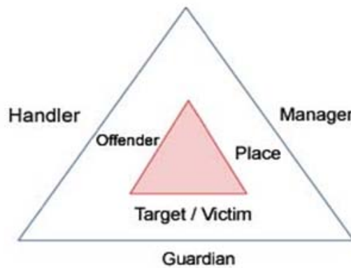
Fig.-1.1: Crime Triangles

Thus crime is highly predictable from the routine activities of everyday life. Eck and Clarke (2003) have extended this simple model by adding some other elements to produce the “crime triangle” [5] as in Fig. 1.1